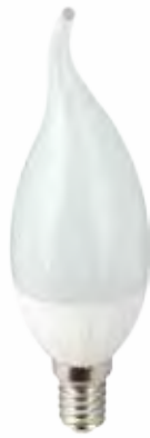
6 W - Ø 37 CANDELA