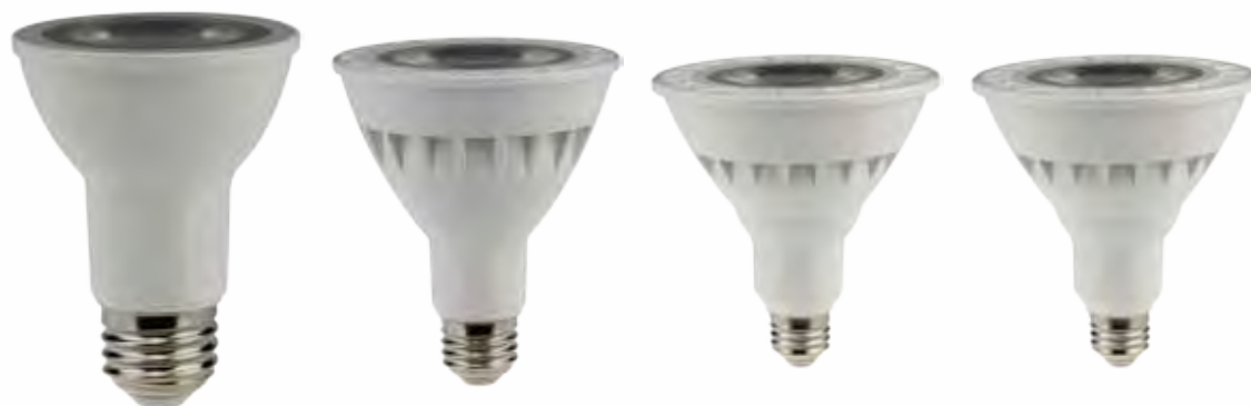
8 W - Ø 63 mm 11 W - Ø 95 mm 13 W - Ø 121 mm 20 W - Ø 121 mm